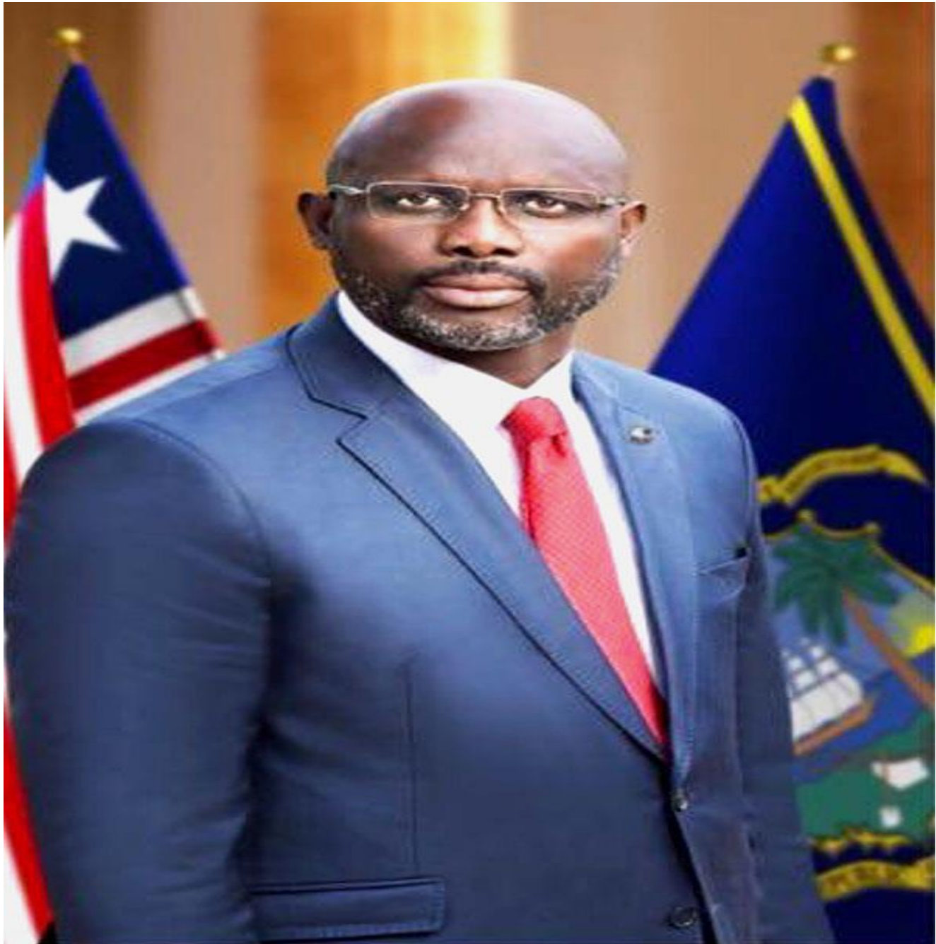
H. E. Dr. GEORGE MANNEH WEAH PRESIDENT Republic of Liberia